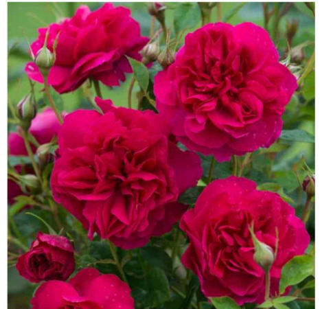
Thomas A’ Becket