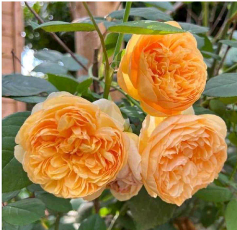
Bring Me Sunshine